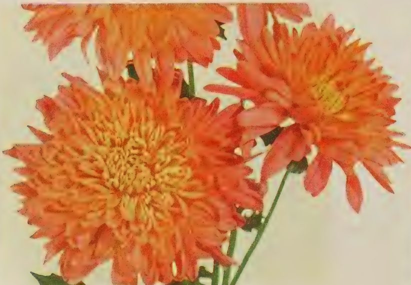
OLIVE LONGLAND. 50c each; 3 for $1.25